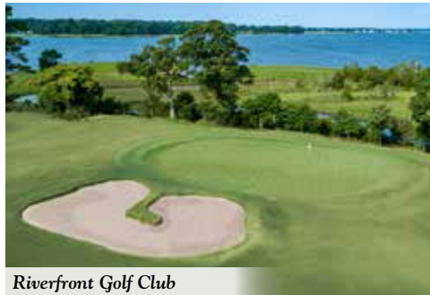
Riverfront Golf Club