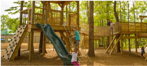
The treehouse playground is a favorite at Hallsley.

A recent survey of Hallsley residents asked, “How satisfied are you with living in Hallsley?” 98% answered there were extremely satisfied, very satisfied, or satisfied with living in Hallsley. Some of their favorite reasons why include their neighbors, great schools, the architecture, the miles of nature trails, the Hallsley Residents Club amenities, and the Director of Fun who plans year-round activities.