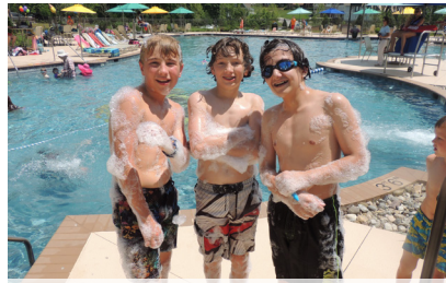
Christmas in July at the Residents pool.