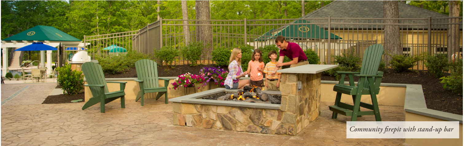
Community firepit with stand-up bar