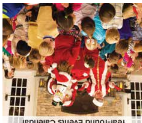
Year-round Events Calendar