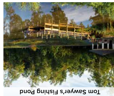
Tom Sawyer's Fishing Pond