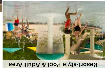
Resort-style Pool & Adult Area