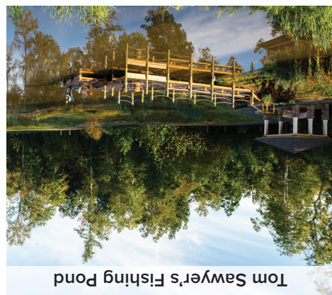
Tom Sawyer's Fishing Pond