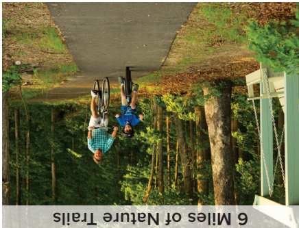
6 Miles of Nature Trails