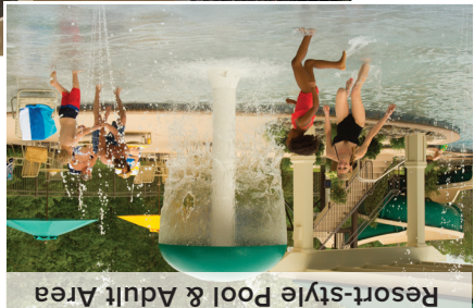
Resort-style Pool & Adult Area