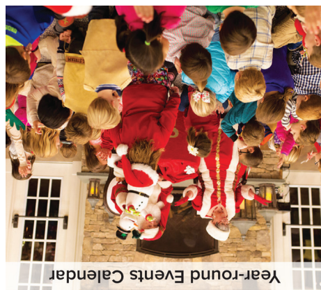
Year-round Events Calendar