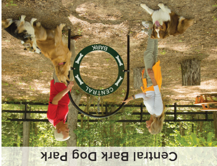
Central Bark Dog Park