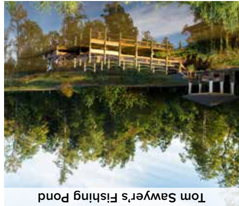
Tom Sawyer's Fishing Pond