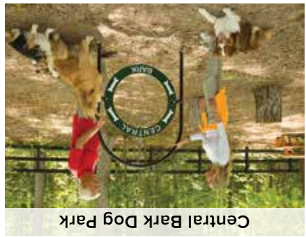
Central Bark Dog Park