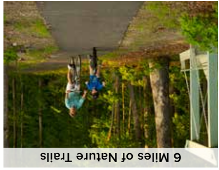
6 Miles of Nature Trails