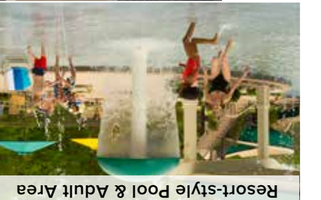
Resort-style Pool & Adult Area