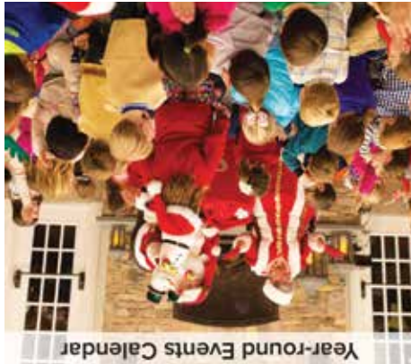
Year-round Events Calendar