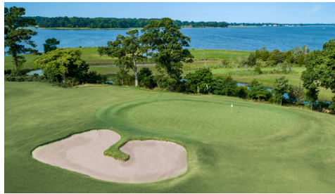
Riverfront Golf Club