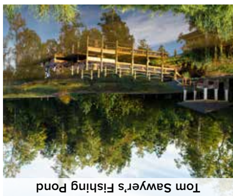
Tom Sawyer's Fishing Pond