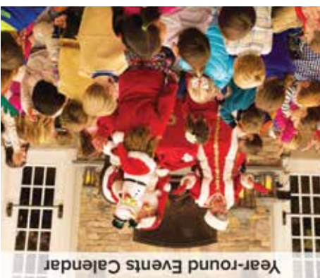
Year-round Events Calendar