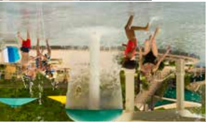
Resort-style Pool & Adult Area