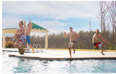
The New Year's Day Polar Bear Plunge.