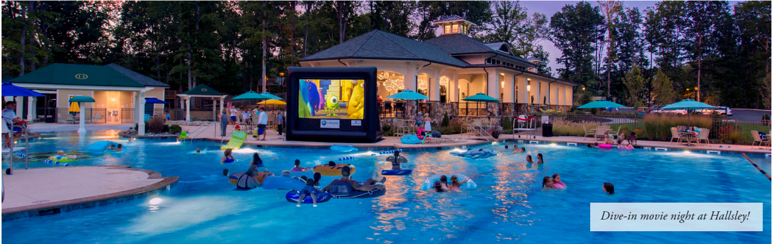
Dive-in movie night at Hallsley!