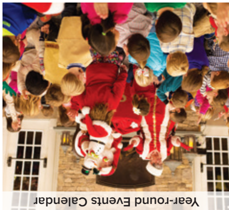
Year-round Events Calendar