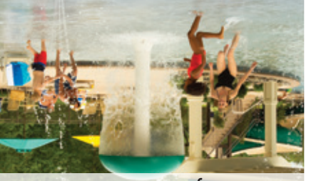
Resort-style Pool & Adult Area