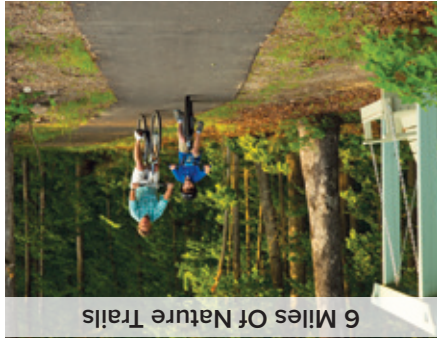
6 Miles Of Nature Trails