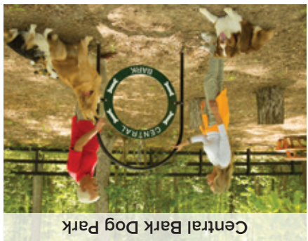
Central Bark Dog Park