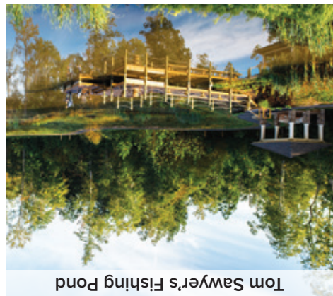
Tom Sawyer's Fishing Pond